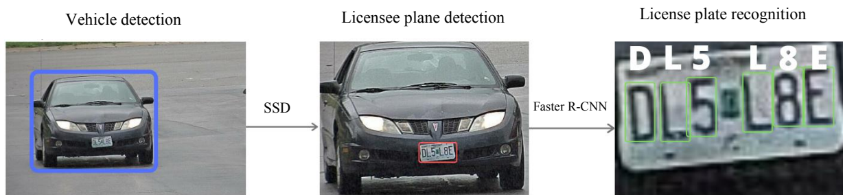
Fig. 1. Three-step approach for license plate detection and recognition

The proposed system consists of a composition of several neural network models. The idea of the composition is that the result of the previous model is fed to the input of the next one, and the whole analysis process is divided into stages. Schematically, the principle of the system is shown in Fig. 1: