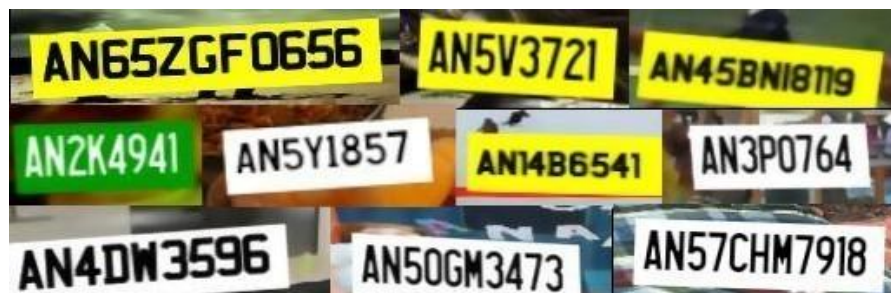
Fig. 2. Samples from generated datasets

For lack of a sufficient number of labeled data sets that meet the requirements of training the numbers recognition model, it was decided to generate a synthetic data set. Such transformations as rotation, blurring and darkening, as well as various sizes and colorings of the license plate, font styles, and the distance between characters were used as augmentations (Fig. 2).